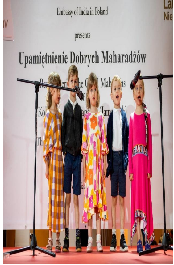
Warsaw 12 th July, 2022